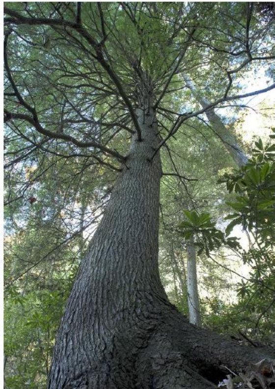
Eastern hemlock