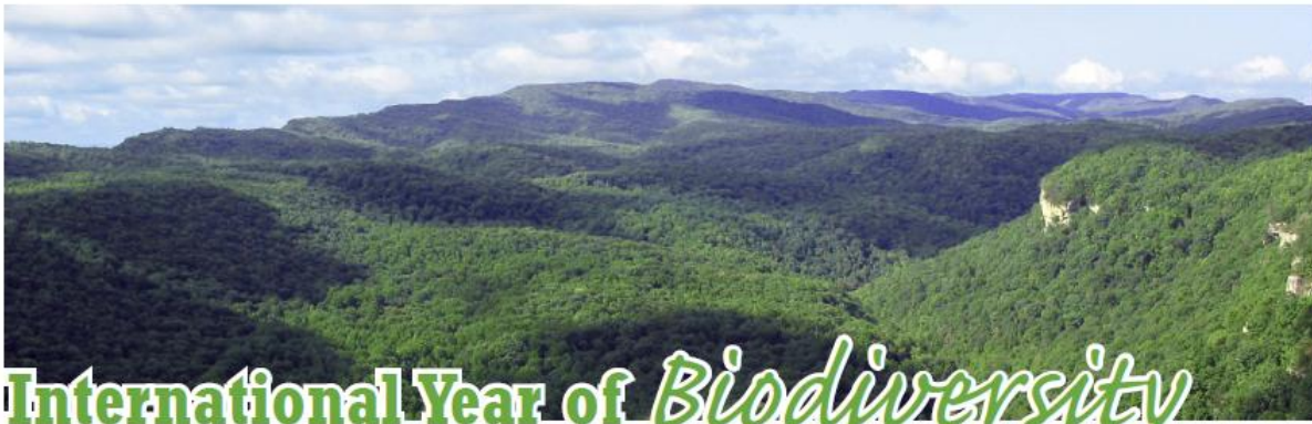
Martin's Fork Watershed