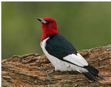
Red-headed woodpecker ~ Lana Hays