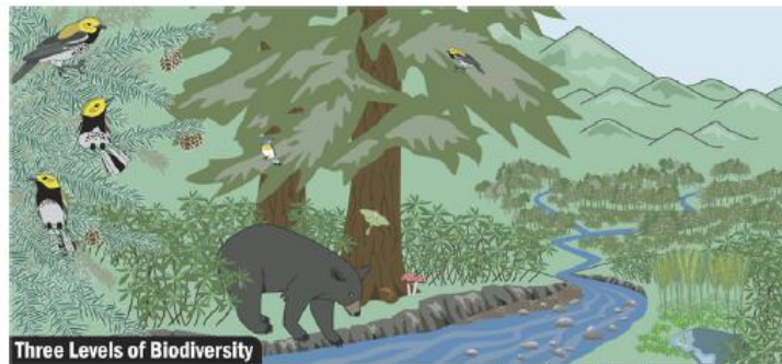
Three Levels of Biodiversity