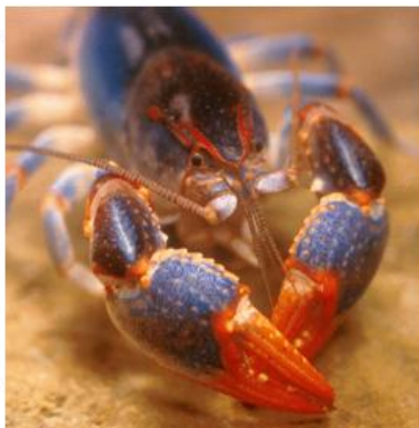
Upland burrowing crayfish ~ Guenter A. Schuster