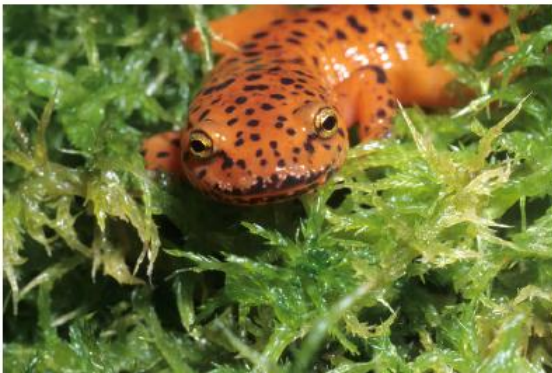
Red salamander

Biodiversity is the variety of all living things and their roles and connections within ecosystems. Simply put, it is the web of life.