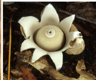
Earth star