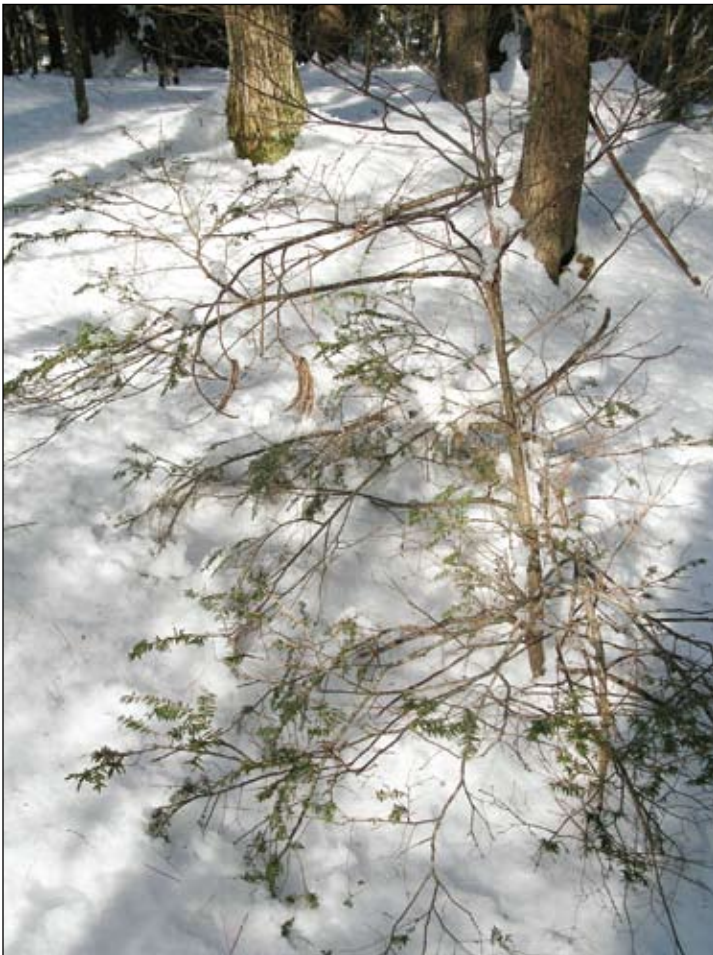
Eastern hemlock regeneration in Maine affected by shoot tip blight

The causal pathogen has been identified as Sirococcus tsugae based on fruiting structures collected in fall 2009 and confirmed by the USDA Animal and Plant Health Inspection Service from morphological characteristics and genetic typing. This was the first report of S. tsugae occurring on eastern hemlock even though this pathogen is known to infect hemlock in the Western United States. It is not known how S. tsugae arrived in eastern forests.