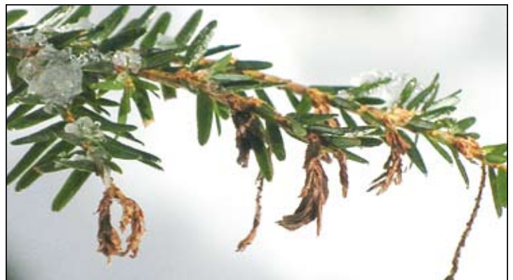
Tip dieback on eastern hemlock infected with Sirococcus tsugae